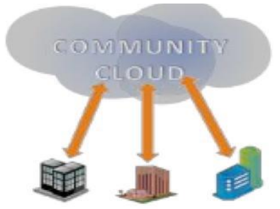
Fig 4: Community Cloud Deployment Model

3. Community Cloud- In this model organizations with similar requirements share a cloud infrastructure. In this model cloud infrastructure is procured jointly by several agencies or programs that share specific needs such as security, compliance, or jurisdiction. It is a generalization of a private cloud, as private cloud is being accessible by one certain organization. The CSP manage community cloud. This model helps to reduce costs as compared to a private cloud