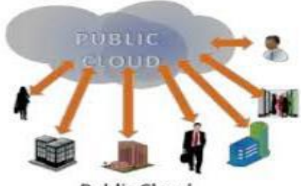
Public Cloud Fig 2: Public Cloud Deployment Model

1. Public Cloud -The public cloud deployment model represents true cloud hosting. In this model services are rendered over a network that is open for public use. Here service can be provided by a vendor free of charge or on the basis of a pay-per-user license policy. In this model cloud infrastructure is available to the general public and is owned by a third party cloud service provider (CSP). This model is best suited for business requirements, utilize interim infrastructure for developing and testing applications. It reduces capital expenditure and brings down operational IT costs